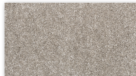
▲ 780 - Beach Cave