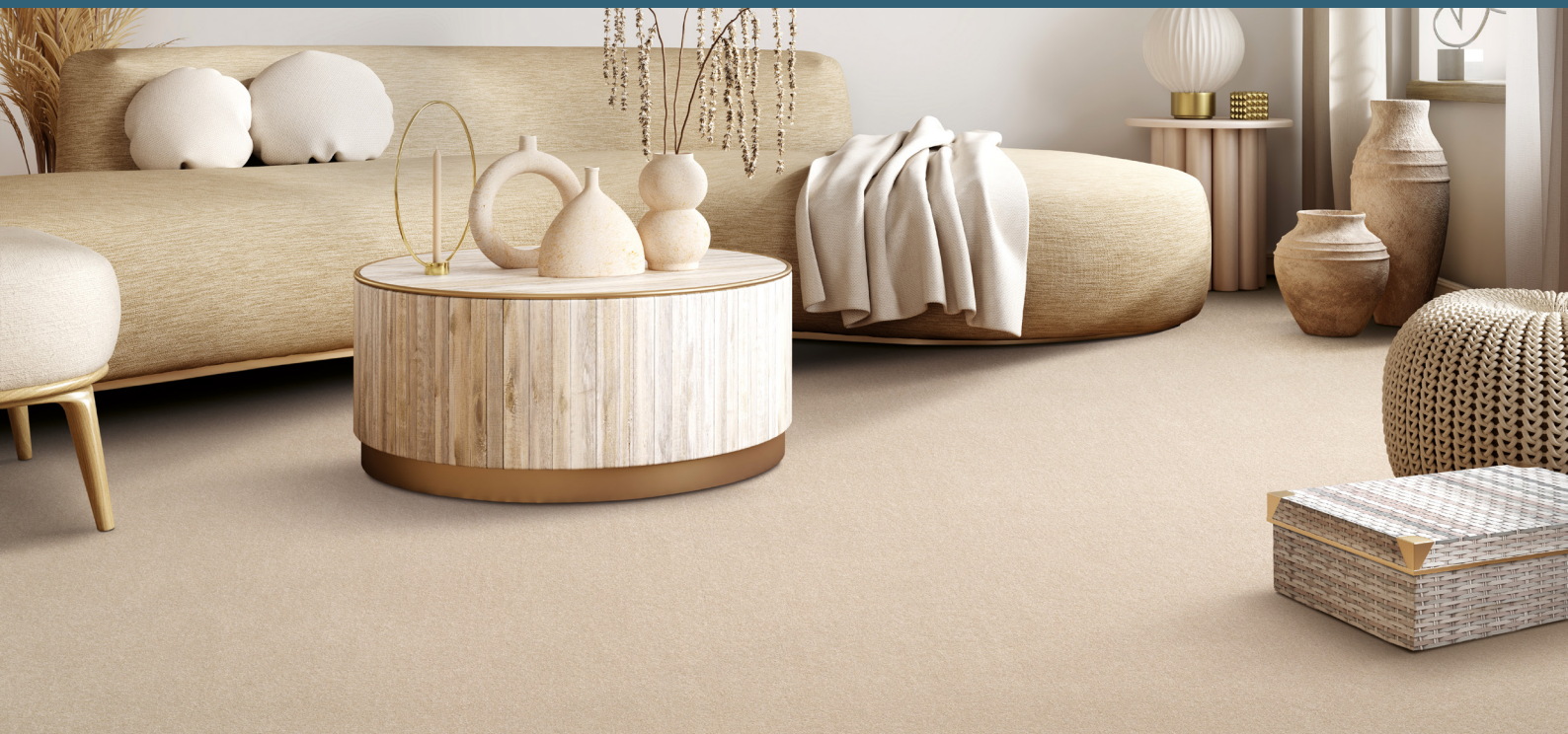
▲ 600 - Cloud Dream