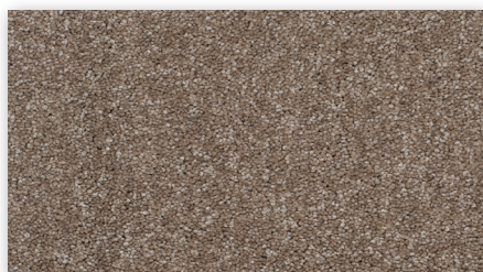
▲ 800 - Choco Shake