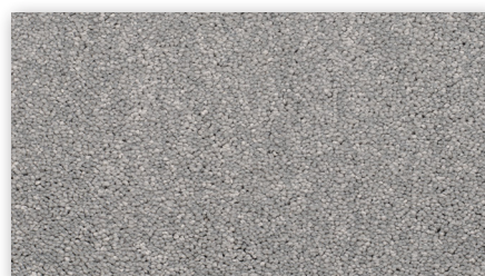
▲ 940 - Gray Glimpse