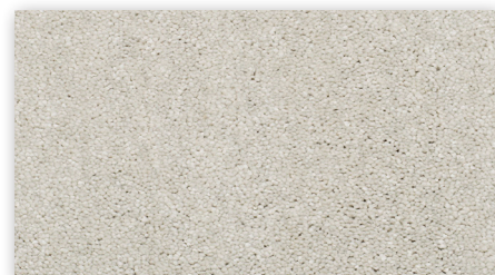
▲ 905 - Ground Mist