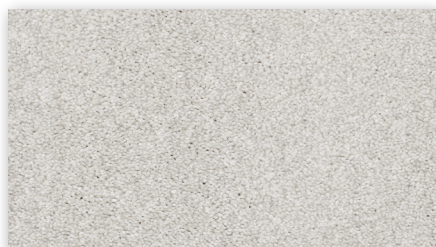
▲ 900 - Glacier Ice