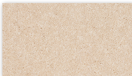
▲ 610 - Champagne Delight