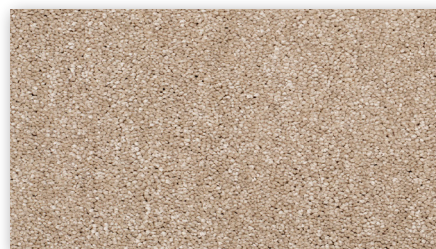
▲ 720 - Sand Drift