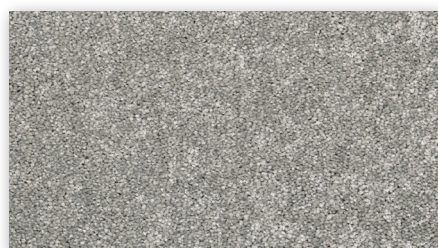
▲ 925 - Disco Ball