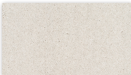
▲ 600 - Cloud Dream