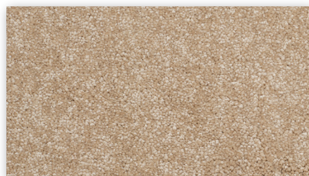
▲ 700 - Almond Latte