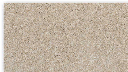
▲ 640 - Macadamia Nut